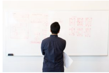
Mapping a workflow by Christina Morillo is available on Pexels.

As noted in Chapter 1: Teamwork Makes the Dream Work: Building the Right Team, when creating new processes for work that crosses institutional boundaries, such as copyright review for archival collections, it is critical to make it a collaborative