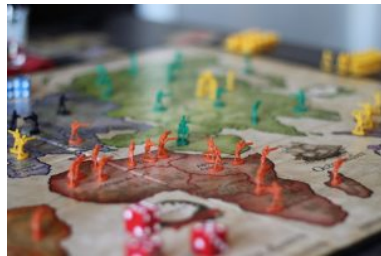
Risk by Dave Photoz is available on Unsplash.

Digitizing archival and cultural heritage material and sharing it online has huge societal benefits. It makes unique resources widely available to students and scholars, helps address inequities in access to cultural resources, and makes cultural production or historically important records easily discoverable to a diverse audience including artists, genealogists, and academic researchers.