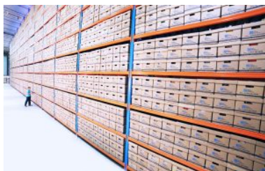
Archival boxes

Archival processing is the combination of tasks and decisions required to organize an archival collection and make it available for research use, and it refers to both arrangement and description of collections.