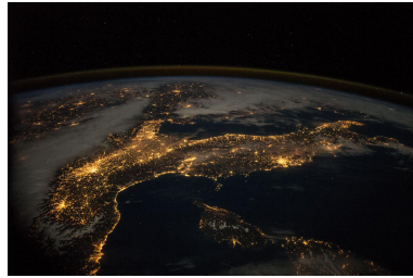
Earth observation time lapse taken by the Expedition 43 crew.

Digitizing our unique cultural heritage collections and making them easily discoverable and accessible around the globe are priorities for archives and special collections. Increasingly, our users expect that our collections be digitized and available online,